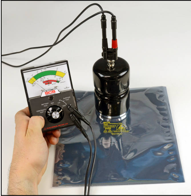
Figure 2. Using the Concentric Ring Probe with the SCS 701 Analog Surface Resistance Megohmmeter