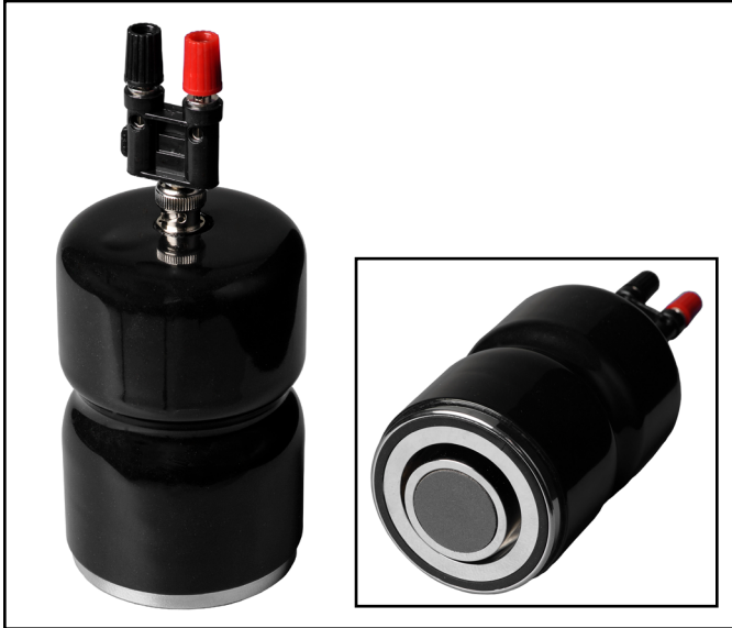
Figure 1. SCS 770007 Concentric Ring Probe